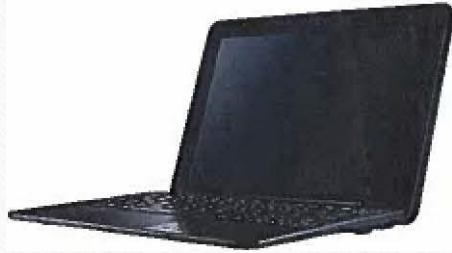
Chromebooks For All Students