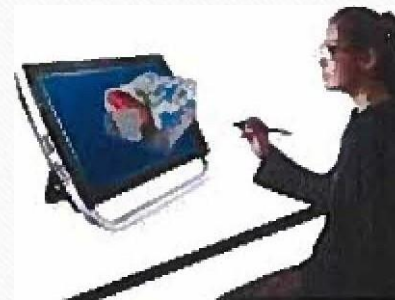
Zspace 30/VR Boards